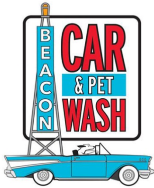
Beacon Car Wash 675 E. Osage St. Dog Wash Available