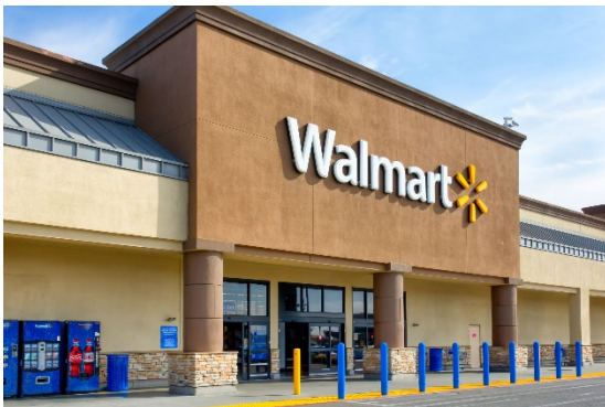
Walmart Supercenter 131 Eureka Towne Center