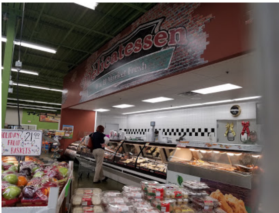
B&H Market 2244 W. Osage St.