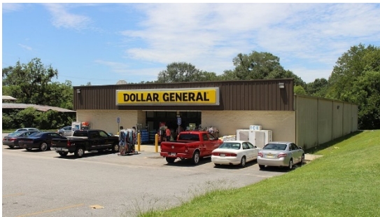
Dollar General 505 E. Osage St.